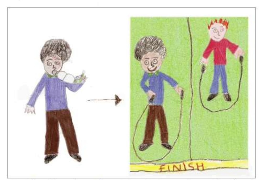
Even though you have asthma it doesn't stop you doing other things!