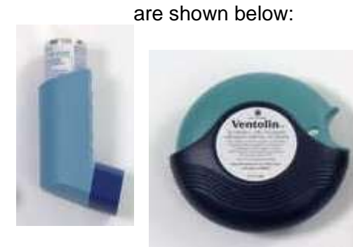
Metered Dose inhaler

Examples of what relievers can look like